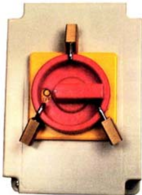
Type D4 80 AMP disconnect in Type S4 enclosure